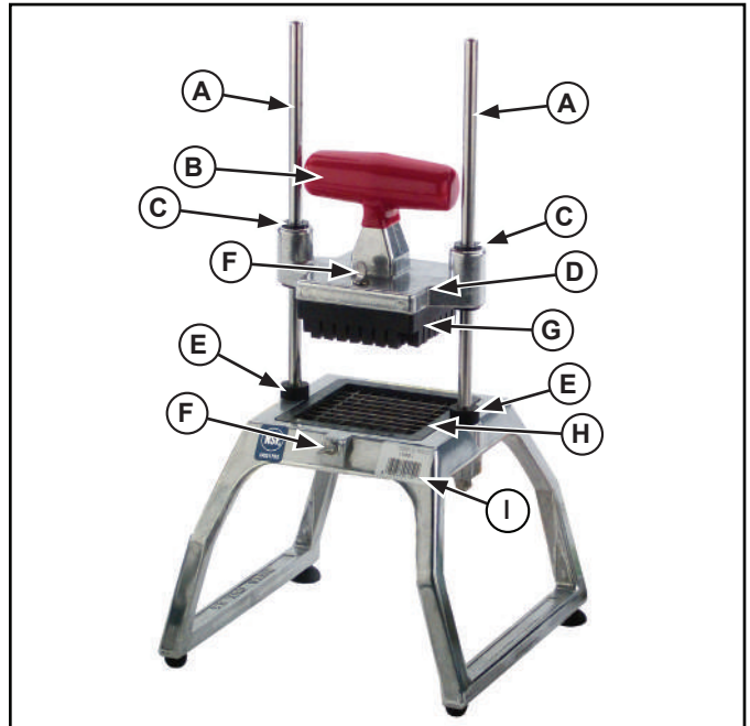
Figure 1. Features and Controls, Table Top Model.